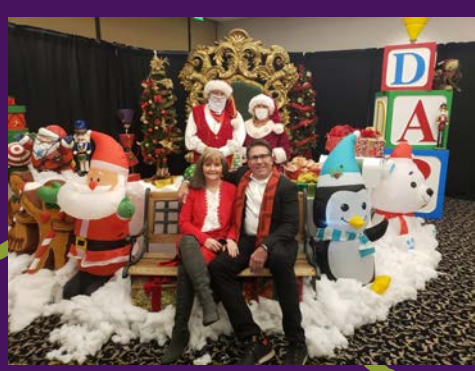
Holiday Mixer 2021